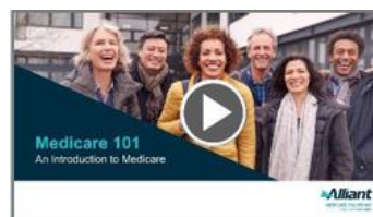
Medicare 101 video