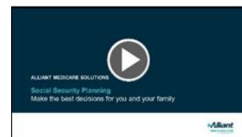
Social Security planning video